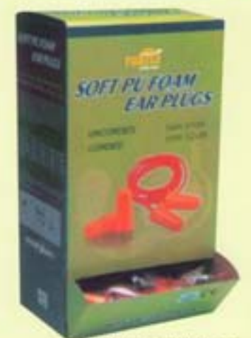
TED-200. Holds 200 pairs TED-200C-Holds 100 pairs