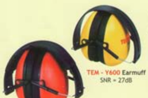
Earmuff (Folding Type)

TEM - Y600/R600 SNR = 28dB CE EN352-1 ANSI S3.19