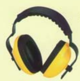
TEM - YZ00 Earmuff SNR = 27dB